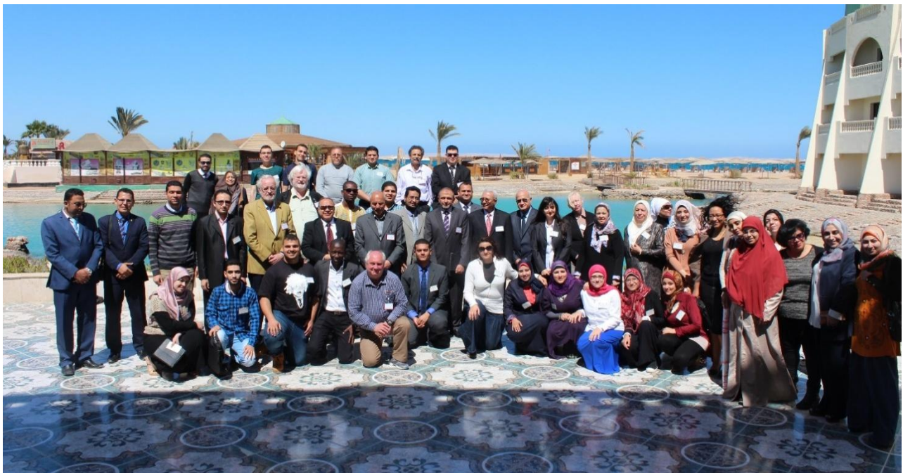
Group photo of the Symposium's participants

Peer-reviewed contributions based on the presentations will be published as a special issue of the Cairo University Journal of Advanced Research (an Elsevier publication). More information on the symposium can be found at: http://iaga.cu.edu.eg .