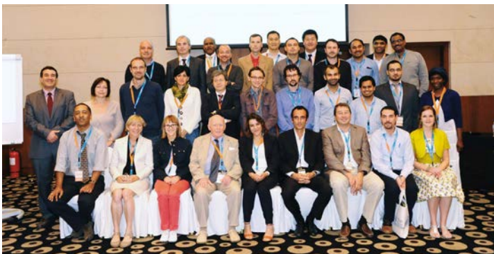
Abu Dhabi STAHY workshop Group