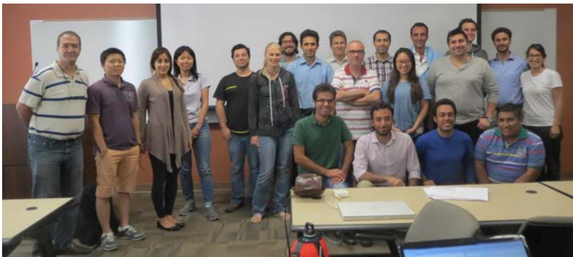
Irvine Short Course Group