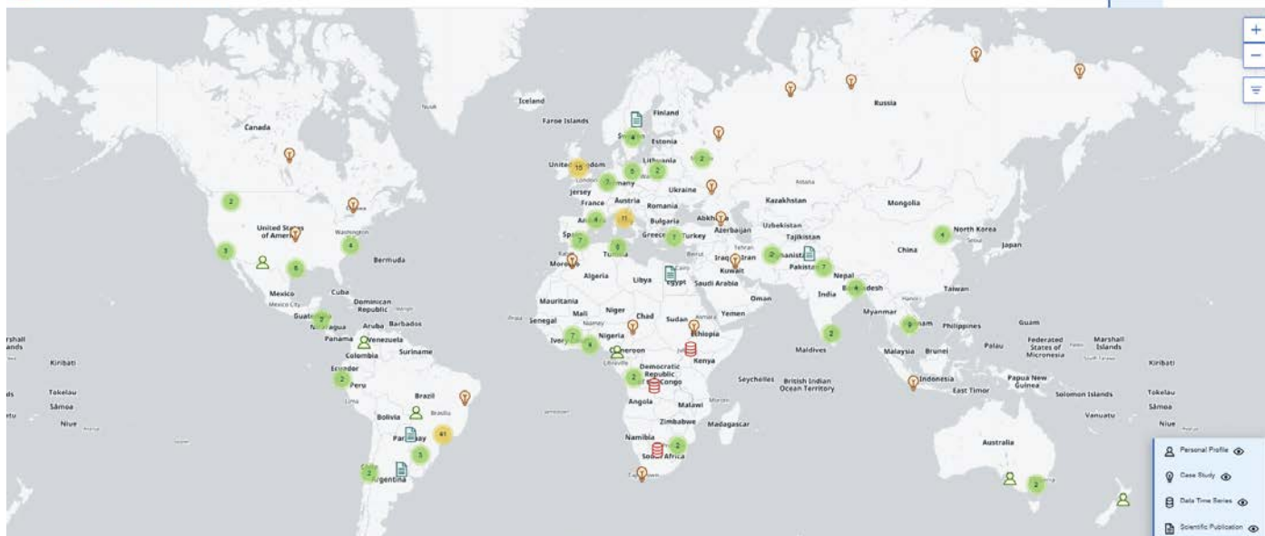
Figure 1. IAHS Digital Water Globe contributions (as of 25 June 2025).