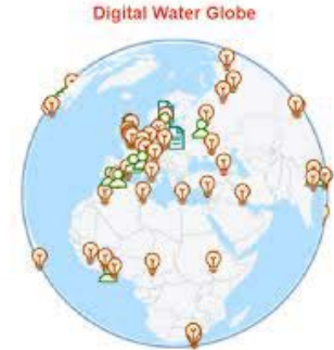
Digital Water Globe

Blog of the Hydrological Sciences division of the EGU. One of the top search queries for HELPING in Google!