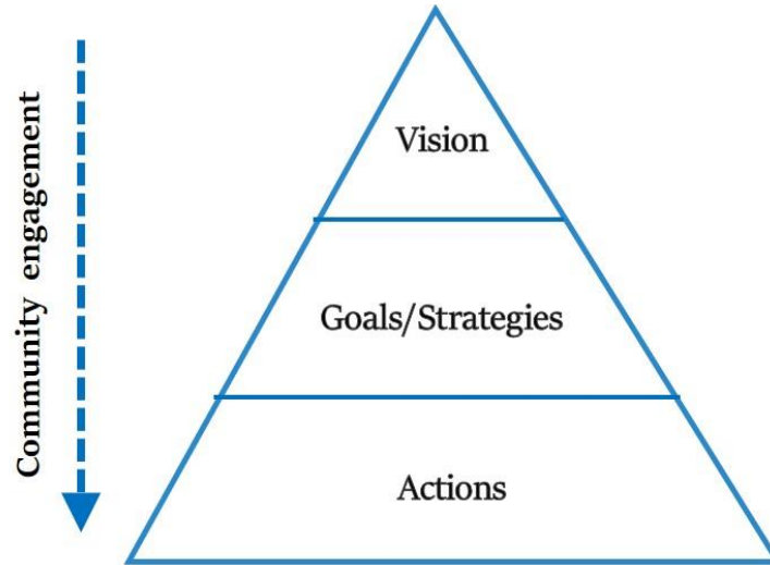
Fig 2. the relations between vision, goals, actions and level of community engagement