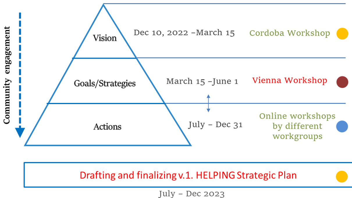
Fig 3. A schematic of time schedule for HELPING Strategic Plan development

Figure 3 shows an overview on time schedule of the process of co-developing the HELPING strategic plan.