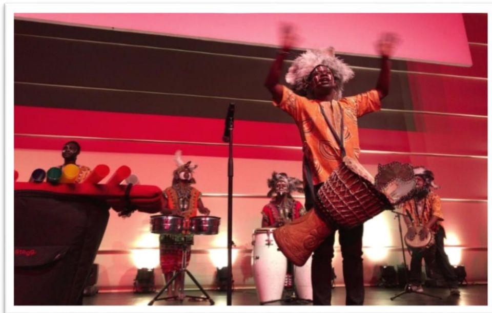
A truly African opening ceremony

The IAPSO-IAMAS-IAGA Joint Assembly officially closed on Friday, 1 September 2017. The conference was a highly successful Joint Assembly organized at Cape Town's CTICC and the first of its kind between the three IUGG Associations. More than 1000 delegates from 54 countries participated in the Joint Assembly.