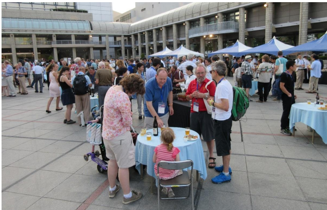
IAG-IASPEI joint ice-breaker

The first joint Scientific Assembly of the International Association of Geodesy (IAG) and the International Association of Seismology and Physics of the Earth's Interior (IASPEI) was held at the Kobe International Conference Center in Kobe, Japan, from 30 July to 4 August 2017 ( http://www.iag-iaspei-2017.jp ) and was a great success. The scientific program included 43 symposia (7 IAG, 27 IASPEI and 9 Joint Symposia), and 1119 oral and poster presentations were given (IAG: 254; IASPEI: 564; Joint: 301). In particular, the nine Joint Symposia attracted many participants and had to be accommodated in two parallel sessions throughout the duration of the conference. The conference had 1107 registered participants from 65 different countries, 360 of those with preference for IAG and 747 for IASPEI. With this number of participants, the Kobe conference was, to our knowledge, the largest IASPEI Assembly ever, although with respect to IAG participants, it was typical in size.