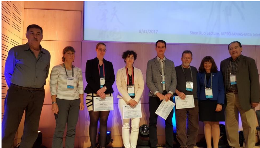
Medalists and Awardees with the IAGA Officers at the Award Ceremony