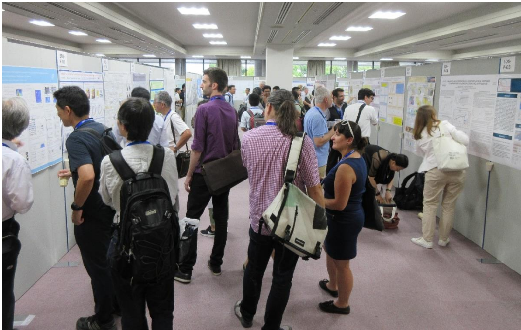
At the poster presentation area

A perspective result of the joint Assembly was the new Inter-Association initiative between IAG and IASPEI to form a joint Sub-Commission on Seismo-Geodesy . The home of this new Sub-Commission within IAG will be the Commission 3 on Geodynamics and Earth Rotation, and in IASPEI it will be the Commission on Earthquake Source Mechanics (ESM).