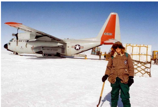
Priscilla Grew 1993: Ski-equipped LC-130 at the Greenland Ice Sheet Project GISP-2 Summit site, elevation 3200 meters.

Geological Survey at the ILP Superdeep Continental Drilling meeting in Jaroslavl, USSR in 1988.