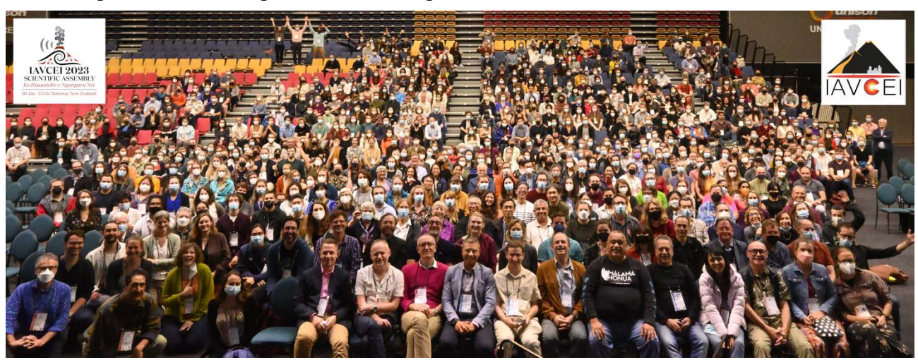
Closing ceremony of the IAVCEI Scientifc Assembly, Rotorua, New Zealand, 3 February 2023

Owing to travel restrictions due to the COVID-19 pandemic, the IAVCEI Scientific Assembly which was planned to be organised in 2021 in Rotorua, New Zealand, had to be postponed twice. Finally, it was held from 29 January to 3 February 2023. Despite a tropical cyclone from 27 to 29 January which caused the closure of Auckland airport and flight cancellations for numerous expected attendees, the assembly was a great success. Fortunately, many attendees had reached New Zealand well in advance in order to participate in pre-conference field excursions on active volcanic systems of the northern island. The assembly was attended by 1,080 people (860 on site, 220 online). 1,258 abstracts were received for a 4 day programme of oral session, poster sessions, and plenary lectures. Early Career Scientists presentations comprised 60% of the presentations.