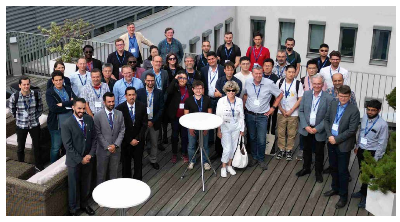
On-site participants of the 2nd IAG Commission 4 Symposium "Positioning and Applications"

51 talks and seven posters were presented within these sessions. We accepted presentation slides and posters as part of the open access <u>Symposium Proceedings</u> at Zenodo. We also held opening and closing sessions, and a special session with a video presentation. Our delegates organised an IAG Sub-Commission 4.3 splinter meeting, a business meeting of IAG Commission 4, and a IAG/IAGA splinter meeting on the topic of "Space Weather Research".