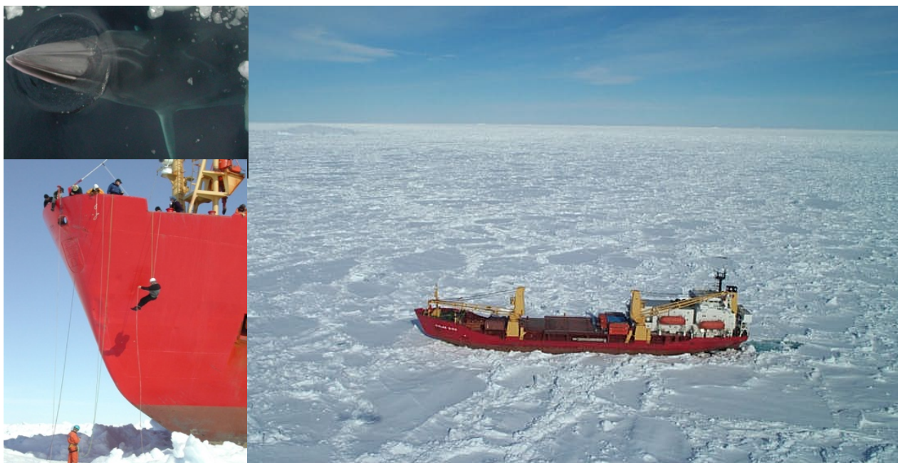
MV Polar Bird beset in sea ice near Amery Ice Shelf, December 2001. Insets: A minke whale visitor and learning to abseil from the ship deck.

Fast forward more than twenty years and I am delighted to have been elected as Bureau Member in IUGG, the first member from the relatively new International Association of Cryospheric Sciences (IACS) which formed in 2007. I am an earth and climate scientist with a passion for international science stewardship. I started my connection with IUGG back in 2011 when I became Secretary General of IACS, a position I held until 2019. Since then, I have been Vice President of IACS, and I have held other roles within and outside of IUGG, for example in the Intergovernmental Panel for Climate Change (IPCC) and the Scientific Committee for Antarctic Research (SCAR). All these activities have massively increased my enjoyment of science and its people, and I hope they have also helped our community.