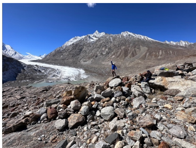
Drang Drung Glacier, Ladakh, India. October 2023.

the Australian Research Council Special Research Initiative ‘ Securing Antarctica’s Environmental Future ’. Lately my focus has been on academic leadership, which has allowed me to spend time on what I really care about – directing impactful science on the causes and consequences of glacier and ice sheet retreat, influencing policy and government, developing the careers of early-career scientists, and fighting inequality in science particularly with respect to gender and diversity.