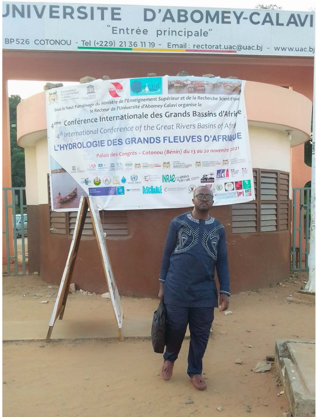
Visit at the Abomey-Calavi University