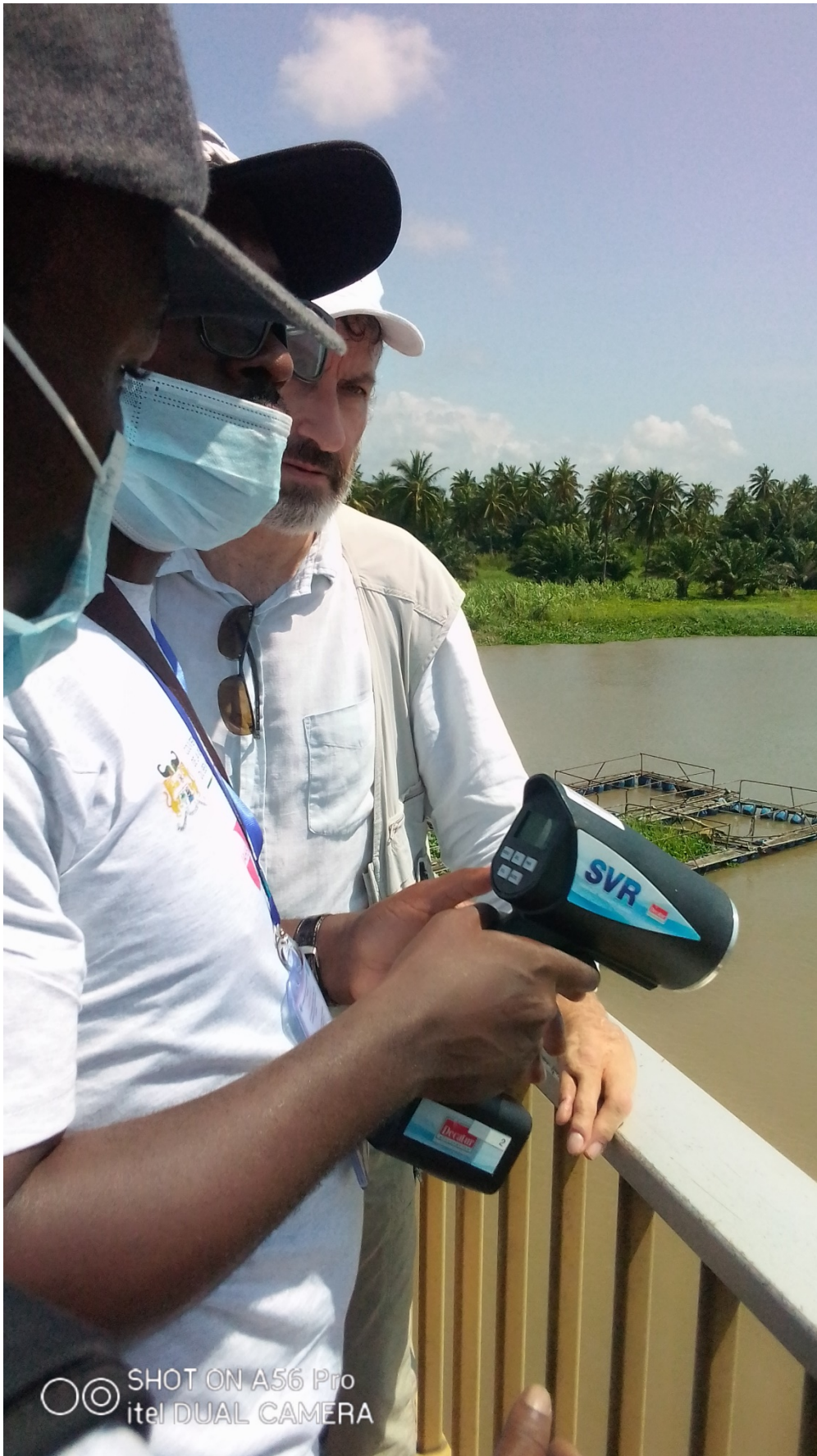
On the Grand Popo bridge learning how the use of the Radar