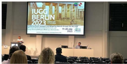
Panta Rhei Symposium

Beyond the conference, Berlin's vibrant culture and spirit of freedom were captivating. The IAHS Gala Dinner held at a traditional Brauhaus provided a fitting conclusion. This visit undoubtedly marks one of the most memorable times in my life.