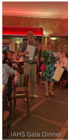
IAHS Gala Dinner