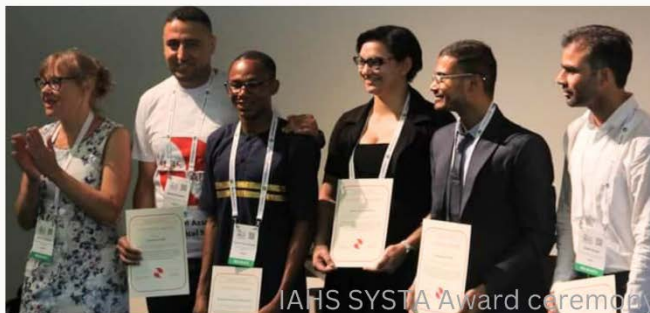
IAHS SYSTA Award ceremony