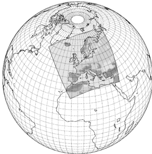
Fig. 2 Rossby Centre regional modelling domain applicable in the context of CE. In a previous project a composite scenario of the whole Nordic region was developed (Rummukainen et al. , 2003).