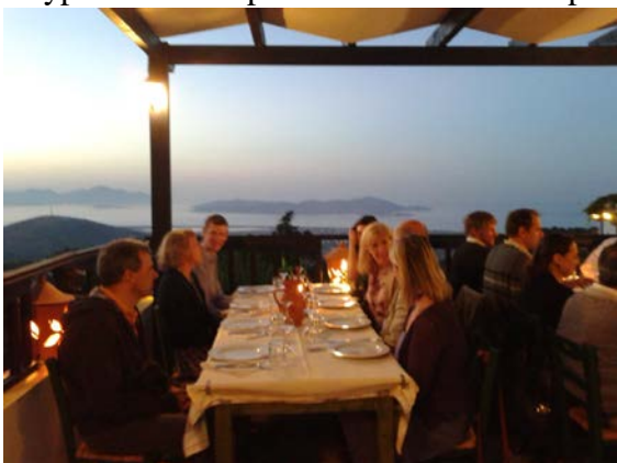
The Retreat dinner was held at a mountainside restaurant as the sun set over the islands of Kalymnos and Pserimos to the north.

Previously, group editorial discussions about HSJ have been limited to working lunches or dinners every two years, fitted in during IAHS assemblies. That format will continue, but the duration of this Retreat enabled in-depth discussion and more Associate Editors to put faces to names that hitherto they only knew in emails.