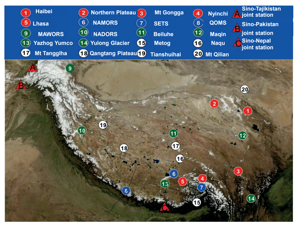
Fig. 1 The station layout in the TPE Programme.

There will be 23 comprehensive observation and research stations in the TPE (Fig. 1). Eleven of them will be managed by the Institute of Tibetan Plateau Research, Chinese Academy of Sciences (ITP/CAS). They will be configured for the study of atmosphere—land interaction. The six constructed stations are: Nam Co Station for Multi-sphere Observation and Research (NAMORS, 30.46°N, 90.59°E; elevation: 4730 m; land-cover: sparse meadow), Qomolangma Station for Atmospheric and Environmental Observation and Research (QOMS, 28.21°N, 86.56°E; elevation: 4276 m; land-cover: sparse grass-Gobi), Southeast Tibet Station for Alpine Environment Observation and Research (SETS, 29.77°N, 94.73°E; elevation: 3326 m; land-cover: grass land), Ngari Desert Observation and Research Station (NADORS, 33.39°N, 79.70°E; elevation: 4270 m land-cover: grassland), Muztagh Ata Westerly Observation and Research Station (MAWORS, 38.41°N, 75.05°E; elevation: 3650 m; land-cover: sparse grass-Gobi desert) and Naqu Station (Naqu, 31.37°N, 91.90°E; elevation:4509 m; land-cover: sparse meadow). Qangtang Plateau Station, Metog Station, Sino-Tajikistan joint station, Sino-Pakistan joint station and the Sino-Nepal joint station will be established by ITP/CAS by the end of 2017.